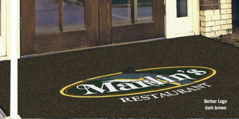
Berber Logo dark brown