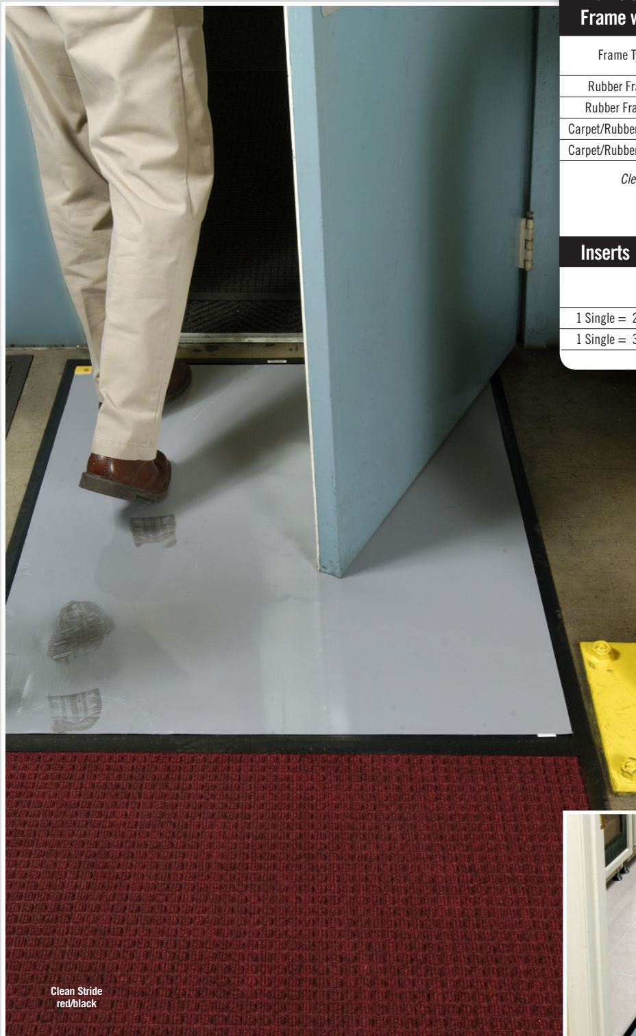
Clean Stride red/black