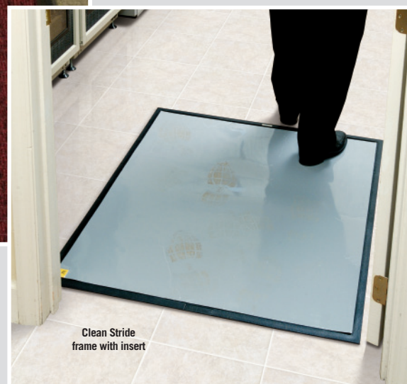
Clean Stride frame with insert