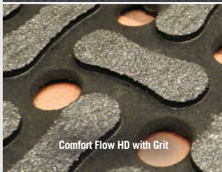
Comfort Flow HD with Grit