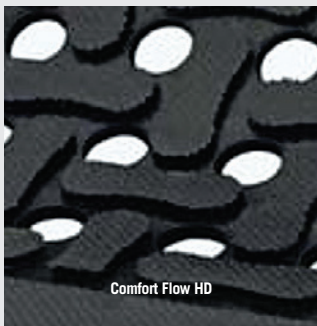
Comfort Flow HD

ANTI-FATIGUE/SLIP RESISTANT/DRY OR WET ENVIRONMENTS/INDOOR-OUTDOOR