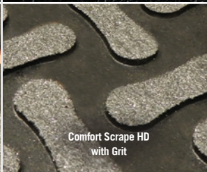
Comfort Scrape HD with Grit