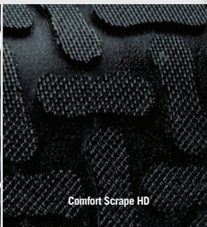
Comfort Scrape HD