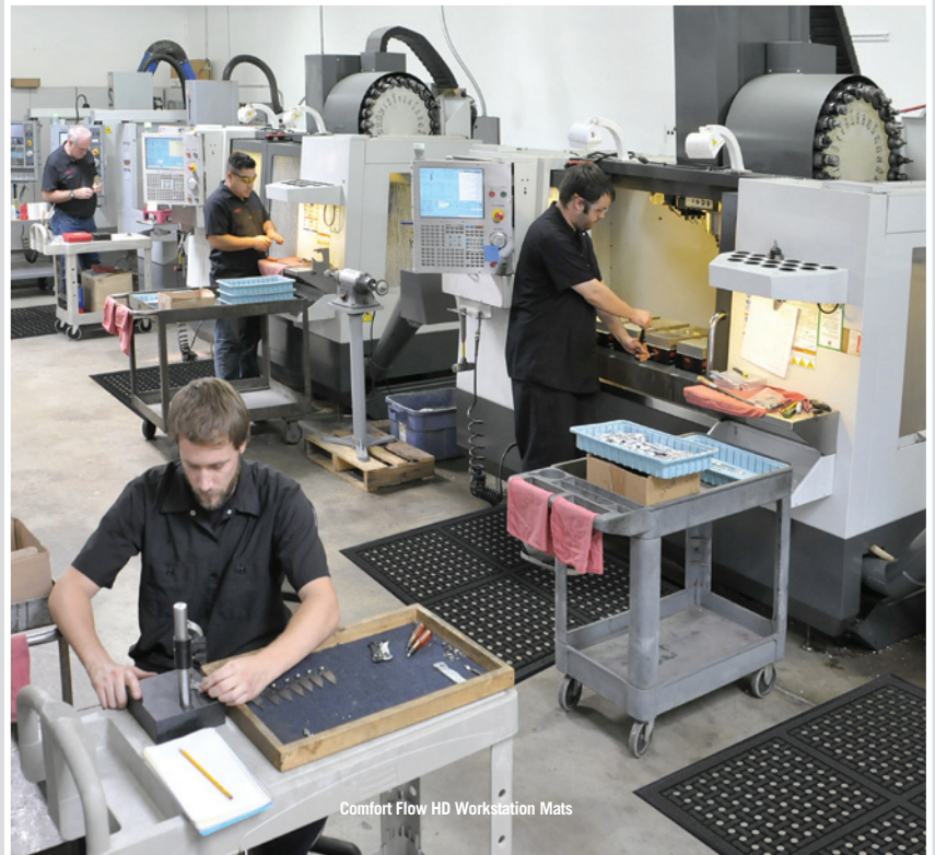
Comfort Flow HD Workstation Mats