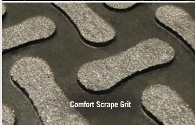
Comfort Scrape Grit