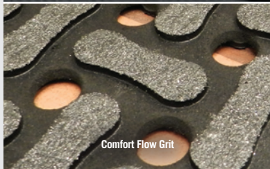
Comfort Flow Grit