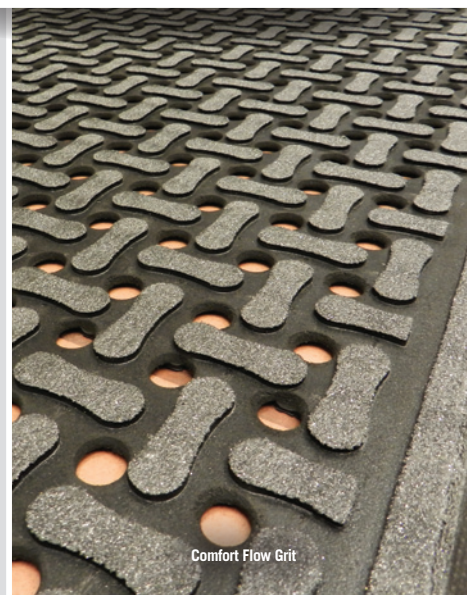
Comfort Flow Grit