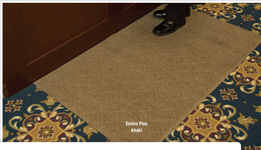
Enviro Plus khaki