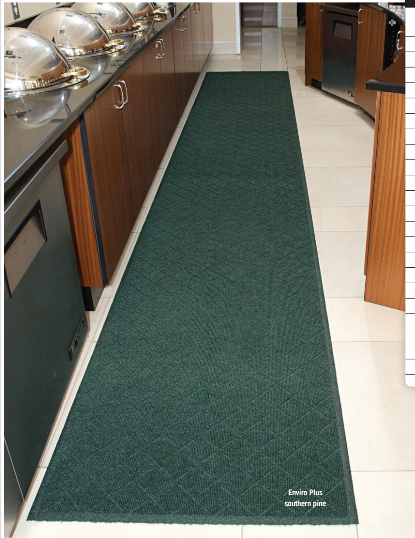
Enviro Plus southern pine