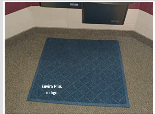
Enviro Plus indigo