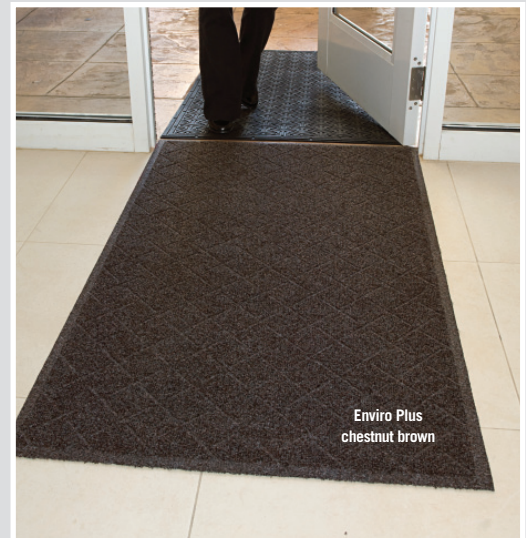
Enviro Plus chestnut brown