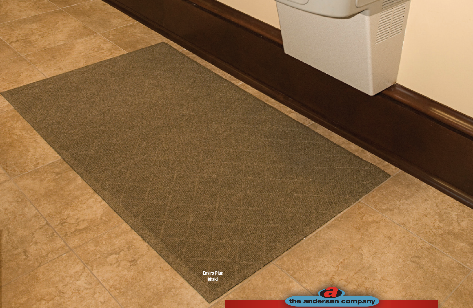
Enviro Plus khaki