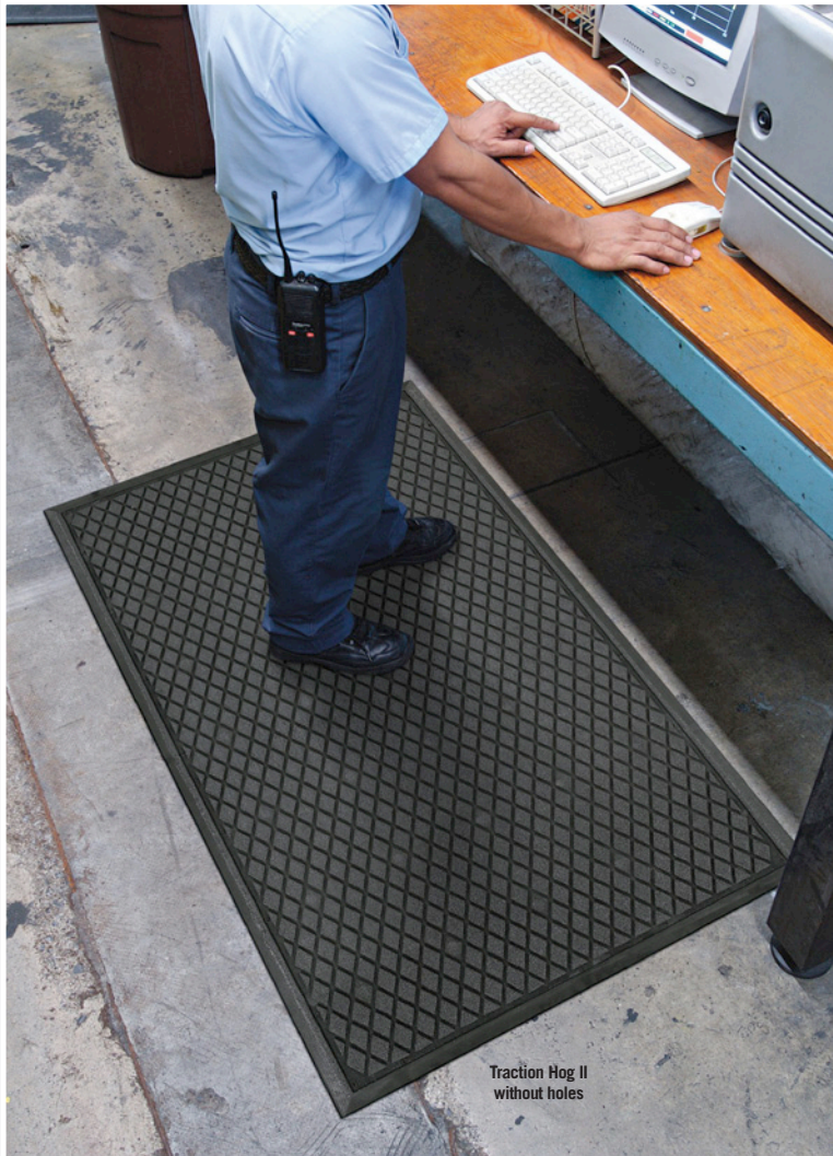
Traction Hog II without holes