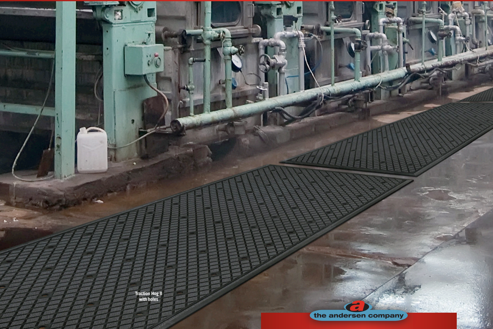
Traction Hog II with holes