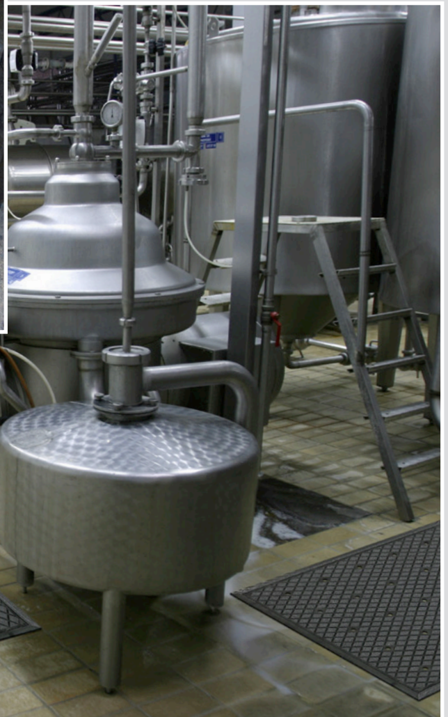
Traction Hog II with holes