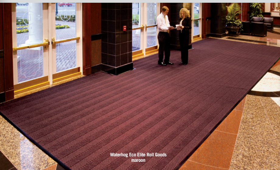
Waterhog Eco Elite Roll Goods maroon