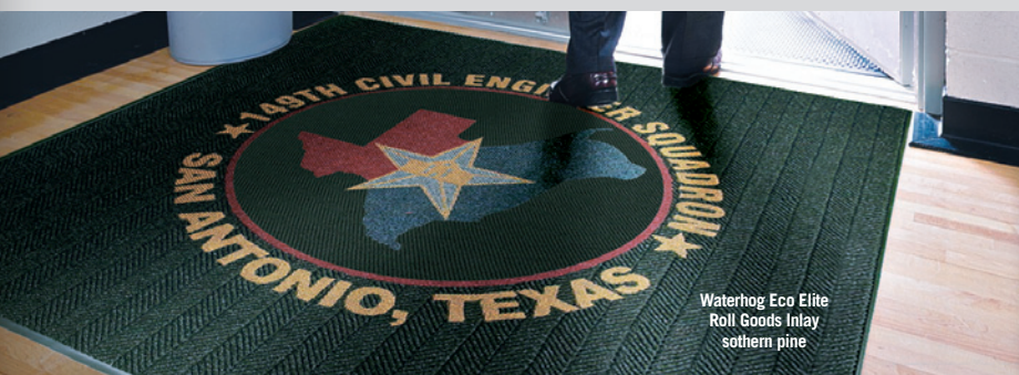
Waterhog Eco Elite Roll Goods Inlay southern pine